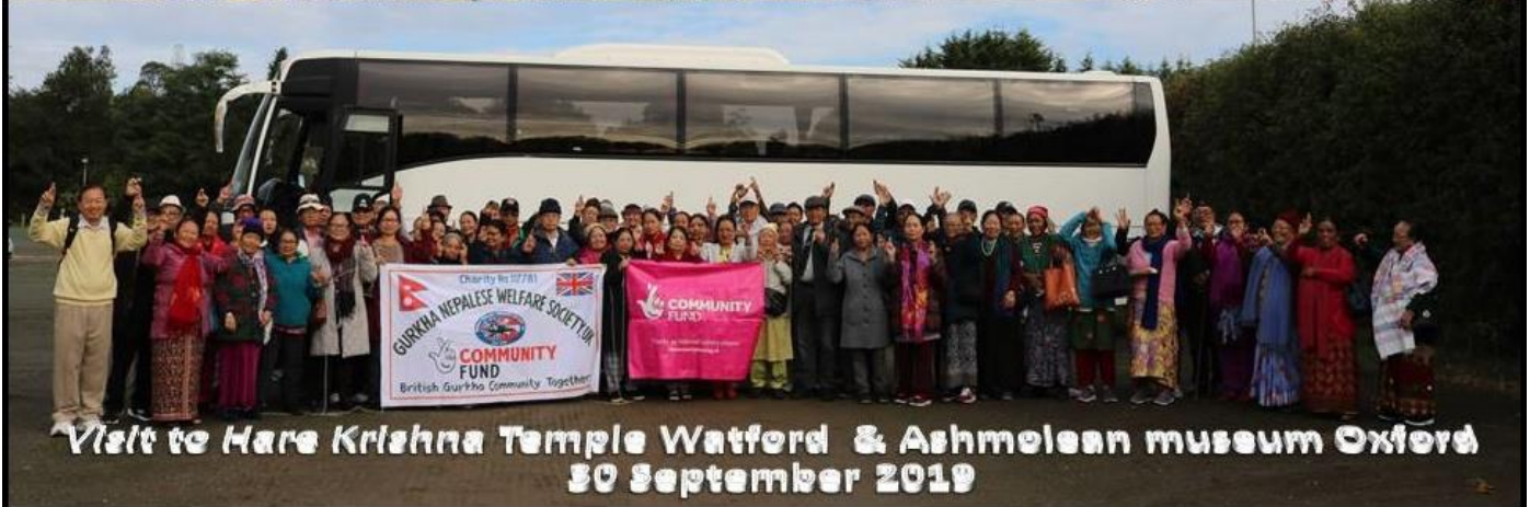
Visit to Hare Krishna Temple Watford & Ashmolean museum Oxford 30 September 2019